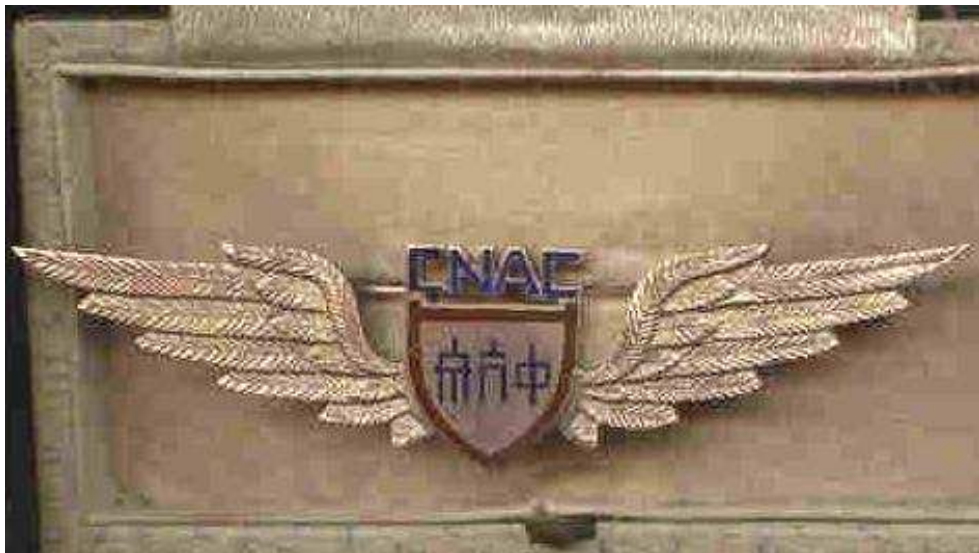
"These wings shined brighter than gold!"