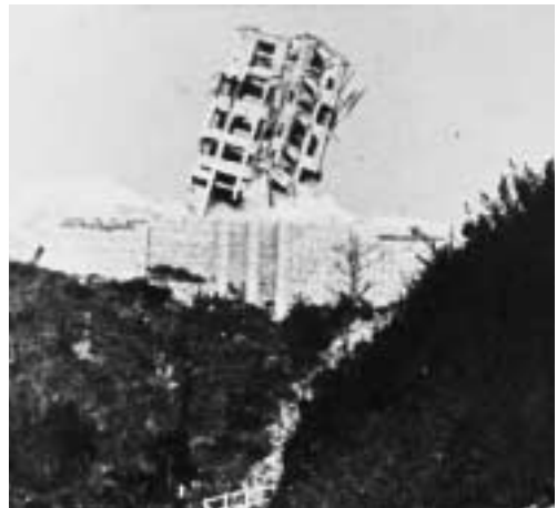
FEBRUARY 26, 1947

An explosion, a cloud of chalky dust and a Japanese symbol of conquest becomes history.